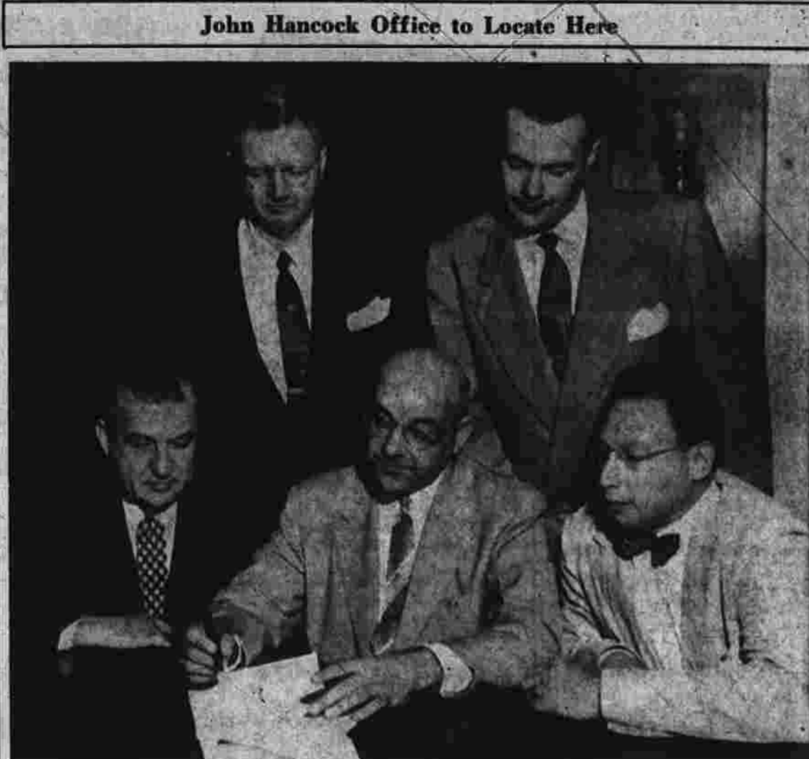
John Hancock Office to Locate Here